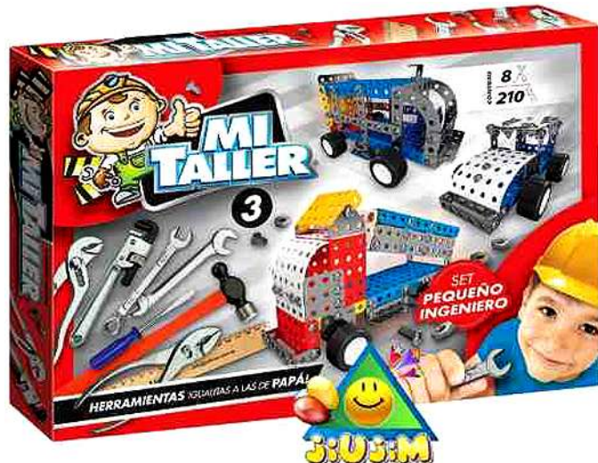
MI TALLER: S1

5. Snippet. 'New' System: MI TALLER Mi Taller means My Workshop in Spanish and the No.3 set below was seen on the Argentine Ebay earlier this year, along with Sets 2 & 1. They have respectively 210, 140, 80 parts with 8, 5, 5 Tools. All 8 Tools are shown on the No.3 lid; those for the smaller sets are the Screwdriver, 2 Spanners, Hammer, & Pliers. The parts look more akin to MECCANO than CONSTRUCTION but unusual parts are 7-hole type Trunnions, 5*5h Flanged Plate, & white Flexible Perforated Plates. The No.3 box measures 50*34cm.